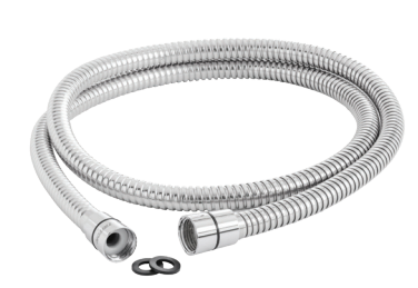
2m Anti-twist Hose - Chrome TSHG1266